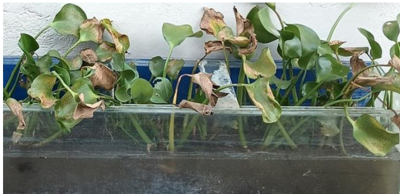
Fig. 2 Observation after 3 days

Samples were analyzed on Days 3, 14, and 21 for the following parameters: