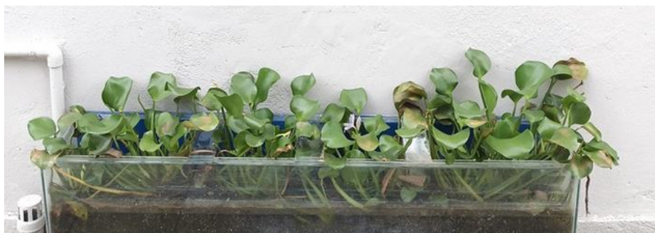
Fig. 3 Observation after 14 days