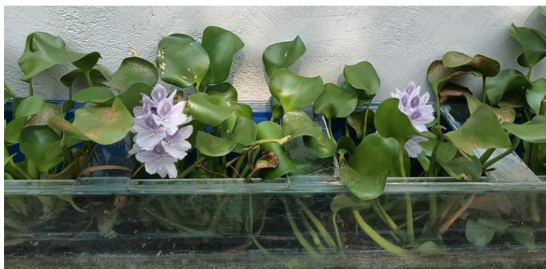
Fig. 4 Observation after 21 days