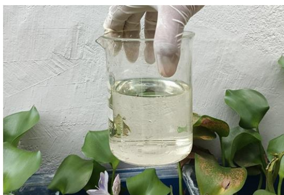
Fig. 5 Treated water after 21 days