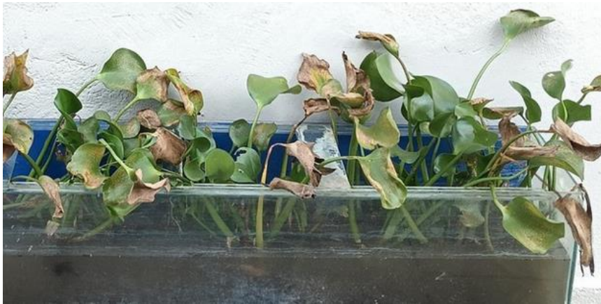
Fig. 1 Water Treatment Setup

Each tank was monitored daily for physical changes such as odor, color, and plant health. No external aeration or mixing was provided; the treatment relied solely on natural plant and microbial interactions. To prevent mosquito breeding and external contamination, a mesh cover was used. Ambient temperature (27–30°C) was maintained throughout the experiment.