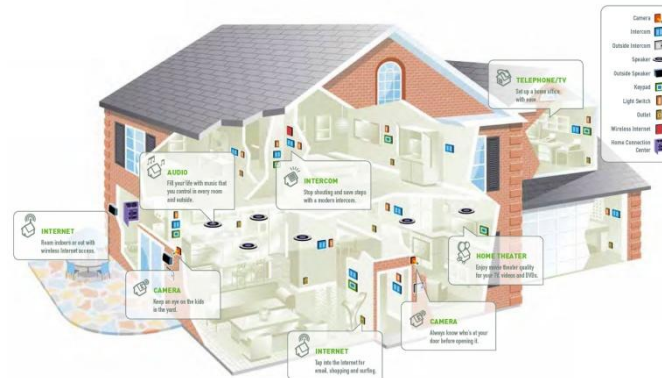
Fig 2.2.1 Communication using IoT in Smart home