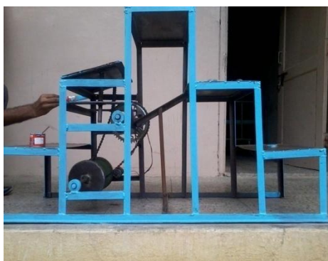
Fig. 2 Fabricated Model