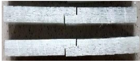
Fig. 4 ILSS Test Specimens

The interlaminar shear strength test is performed according to ASTM D3846 to measure the interlaminar shear strength of composites. ILSS test is conducted using universal testing machine of 10 ton capacity. This test provides the shear strength between the laminas of the composite material. The test was conducted in compression mode and specimen is placed between the fixtures to restrict the buckling.