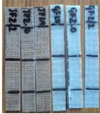
Fig. 3 Flexural Test Specimens

kalpak universal testing machine of 10 tonne capacity. Flexural test conducted using three point bend fixture and the cross head speed was set to 1.3mm/min. Force and deflection history are obtained by computer controlled UTM.. The geometry and dimension of the specimen is shown in fig.3.