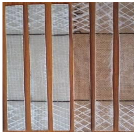
Fig. 2 Tensile Test Specimens

The tensile properties of the bidirectional composite specimens are determined by a series of tensile test in accordance with the ASTM D3039 test standard. A tensile test is done by mounting the specimen in the universal testing machine (UTM) and tension was continuously applied until fracture. Tensile force was recorded as a function of increase in gauge length. The longitudinal tensile strengths and young's modulus are determined without strain gauge bonded. The prepared test samples are shown in Fig. 2.