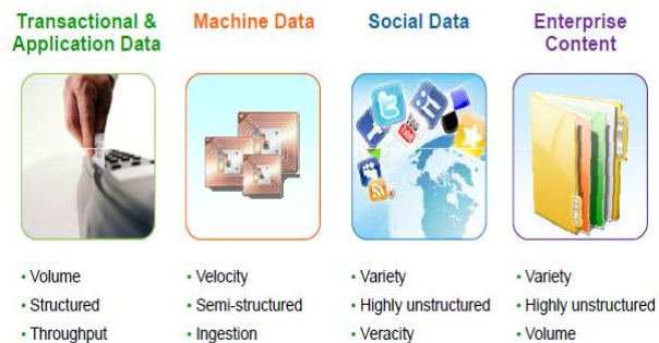
Fig 1: 5V's Model to specify properties of Big Data

To solve these issue; there is need to develop some suitable and optimized platforms for management of the new data, metadata and information analysis which improve the process of the Big Data Analytics.