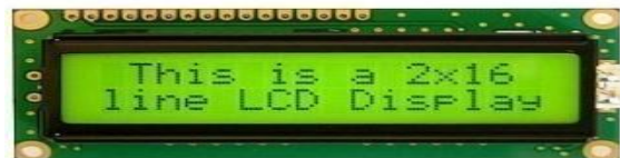
Fig no. 2 LCD Display