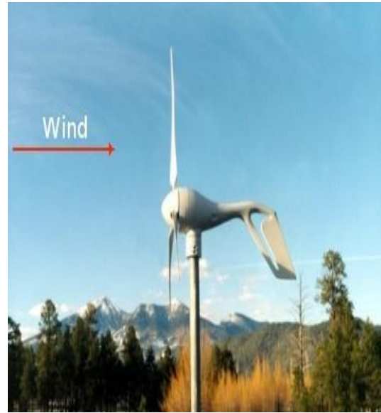
Figure 2 Upwind Wind Mill