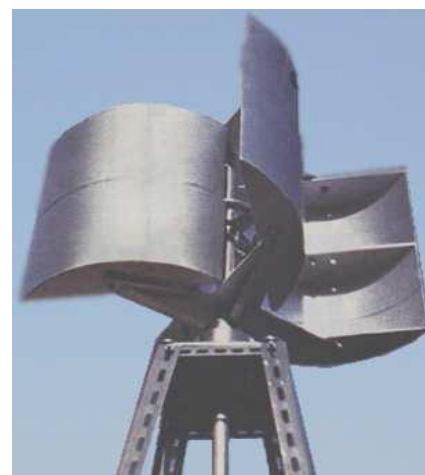
Figure 6 Savonius Wind Mill

The Savonius wind turbine is one of the simplest turbines. It is a drag-type device that consists of two to three scoops. Because the scoop is curved, the drag when it is moving with the wind is more than when it is moving against the wind. This differential drag is now what causes the Savonius turbine to spin. Because they are drag-type