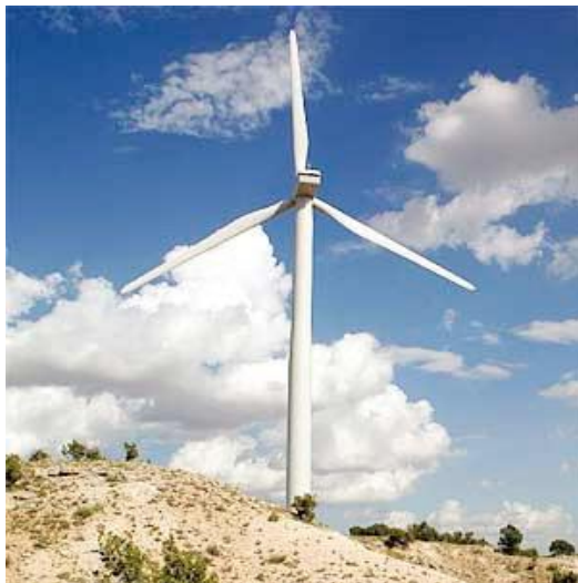
Figure 1 Horizontal Wind Mill

The horizontal wind turbine is a turbine in which the axis of the rotor is parallel to the wind stream and the ground. Most HAWTs today are two- or three-bladed, though some may have fewer or more blades.