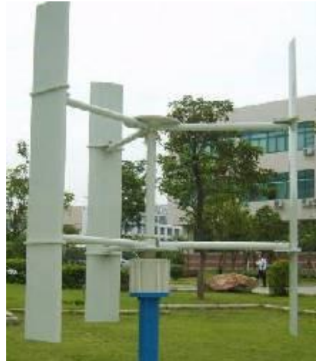
Figure 5 Giromill Wind Mill

The Darrieus turbine is then powered by the lift forces produced by the airfoils. The blades allow the turbine to reach speeds that are higher than the actual speed of the wind, thus, this makes them well-suited to electricity generation when there is a turbulent wind.