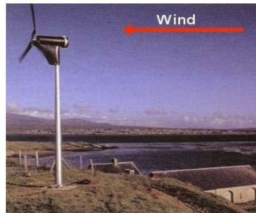
Figure 3 Downwind Mill