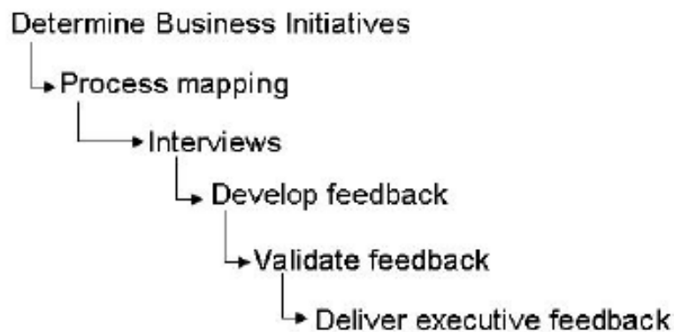
Figure 1. Second batch of interview and analysis process

There are several customs to accumulate qualitative data that have a case study research centre of attention. Examples include questionnaires, interviews and observation [15] [16]. After vigilantly analyzing data collection methods, interviews and observation were noticed as the most appropriate approaches for data gathering due to the occasion of the author to go to the company every day.40 people were identified as being potential sources of information for this research. The first lot of interviews involved 20 of the 40, and the main purpose was to record the modern development process and computer systems used to support the process. They involved people from all levels in the company. The second batch of interviews which involved another 20 of the 40 people identified, meant to gather and analyze problems related to present new product introduction processes and procedures. Figure 1 demonstrate the procedure used for the second lot of interviews: For this second lot, ‘the appropriate subjects’ were estimated to be people who had a complete information of the business, and who would be in a situation to categorize the exertion the organization has to introduce new products. It proposes that topic must be in a situation to generalize about business performance. Merely employees at the level of manager or higher cadre were considered for contribution in the study.