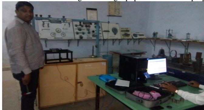
Fig.2. Actual Experimental setup of gear pair on FFT

With the use of experimental set-up we can identify the natural frequencies for the component using the principle of resonance. Typically, FFT analyser is used for determining the same. The software analysis can yield the modes of the nth order, which in turn can be verified further using the testing equipments for this purpose (future scope).