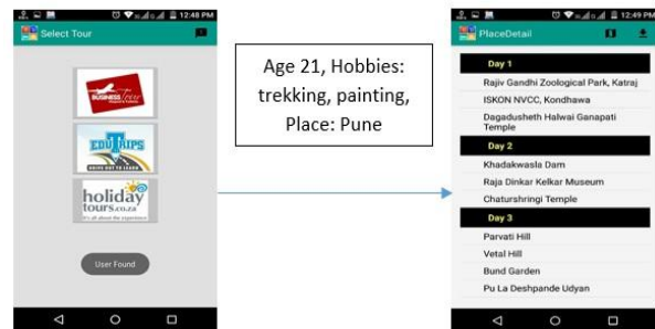
Fig 1: Selection of tour

Experimental result on Input set (Age 21, Hobbies: trekking, painting, Place: Pune) is shown in below diagram.