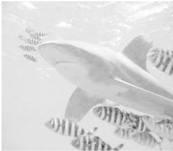
Fig (e) Image after applying Webers Law

In order to verify the algorithm we do simulation experiment. We make use of MATLAB as experiment tool. In the first step Homomorphic filtering is used to correct non uniform illumination and to enhance the contrast in the image, In second step Gaussian filtering is used to smooth the image in homogenous areas. Then we apply wavelet transform which results into noisy image. By using webers law we get enhanced under water image. Results are shown by Figures above.