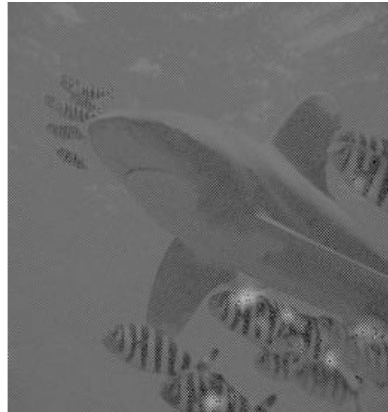
Fig (b) Image after Homomorphic Filtering