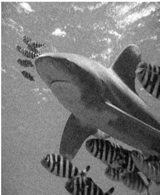
Fig (a) Noisy under water image