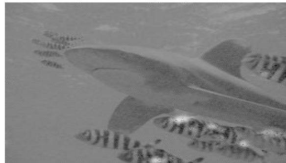
Fig (c) Image after Gaussian low pass filtering