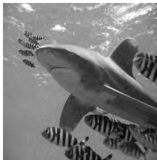
Fig (d) Image after wavelet transform